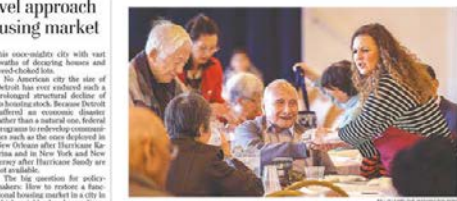
Fraternity and turkey Many guests, right, were guests at the Knights of Columbus hall in Arlington, where volunteers provided Thanksgiving dinner to hundreds of people. Others spent the holidays fighting for humans in stores, helping to usher in a different attitude in the retail industry.