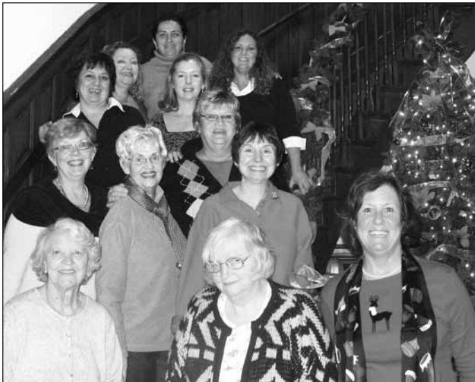
Ladies U-Knighted Christmas Party, December 2009.