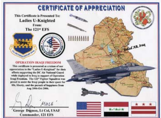
Copy of Certificate of Appreciation presented to LUK