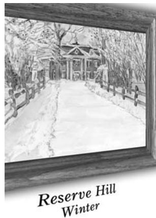
Reserve Hill Winter